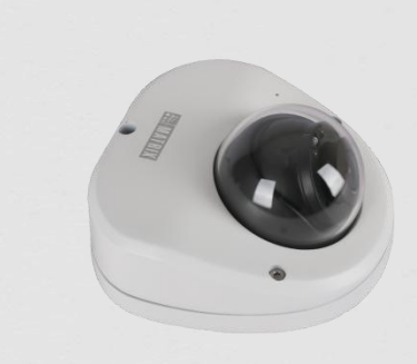
SATATYA RIDR50FL40CWP 5MP IR Ruggedized Camera with 4.0mm Lens

Matrix Ruggedized Series IP Cameras are specifically designed for the demanding Transportation industry ie Railways and Roadways. Powered by Low light Sensitivity and High quantum efficiency Sensor it offers superior Video Quality and performance necessary to capture the events happening at a zap speed in/from a moving vehicle.