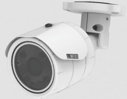
SATATYA MIBR20FL36CWP 2MP IR Bullet Camera with 3.6mm Lens with Audio

Matrix Professional Series IP Cameras are built using superior components such as Sony STARVIS sensor and higher MTF lens to offer unmatched image quality especially during the low light conditions. Powered by True WDR algorithm, these cameras offer consistent image quality even in highly varying lighting conditions. Built in intelligent analytics including Intrusion Detection, Trip Wire, etc. ensure real-time security. Moreover, H.265 compression and Automatic Motion based Frame Rate Reduction save bandwidth and storage up to 50%.