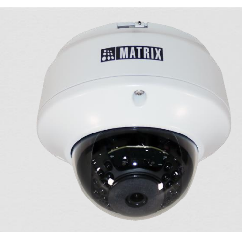
SATATYA CIDR50FL40CWP 5MP IR Dome Camera with 4mm Lens with Audio

Matrix Project Series Dome IP Cameras are built using superior components such as Sony STARVIS sensor and high MTF lens to offer unmatched image quality especially during the low light conditions. Powered by True WDR algorithm, these cameras offer consistent image quality even in highly varying light conditions. Built in intelligent analytics including Motion Detection, Intrusion Detection, Trip Wire, etc. ensure real-time security. Moreover, H.265 compression and Automatic Motion based Frame Rate Reduction save bandwidth and storage up to 50%.